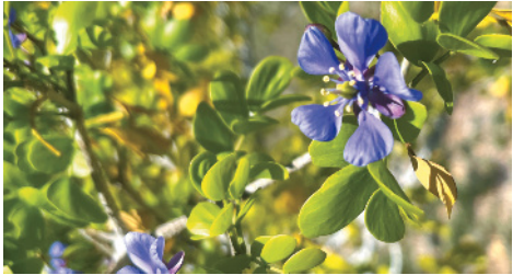
Lignumvitae bloom. Above: writer and barracuda. Below: No-motor zone detail (good paddling or poling).